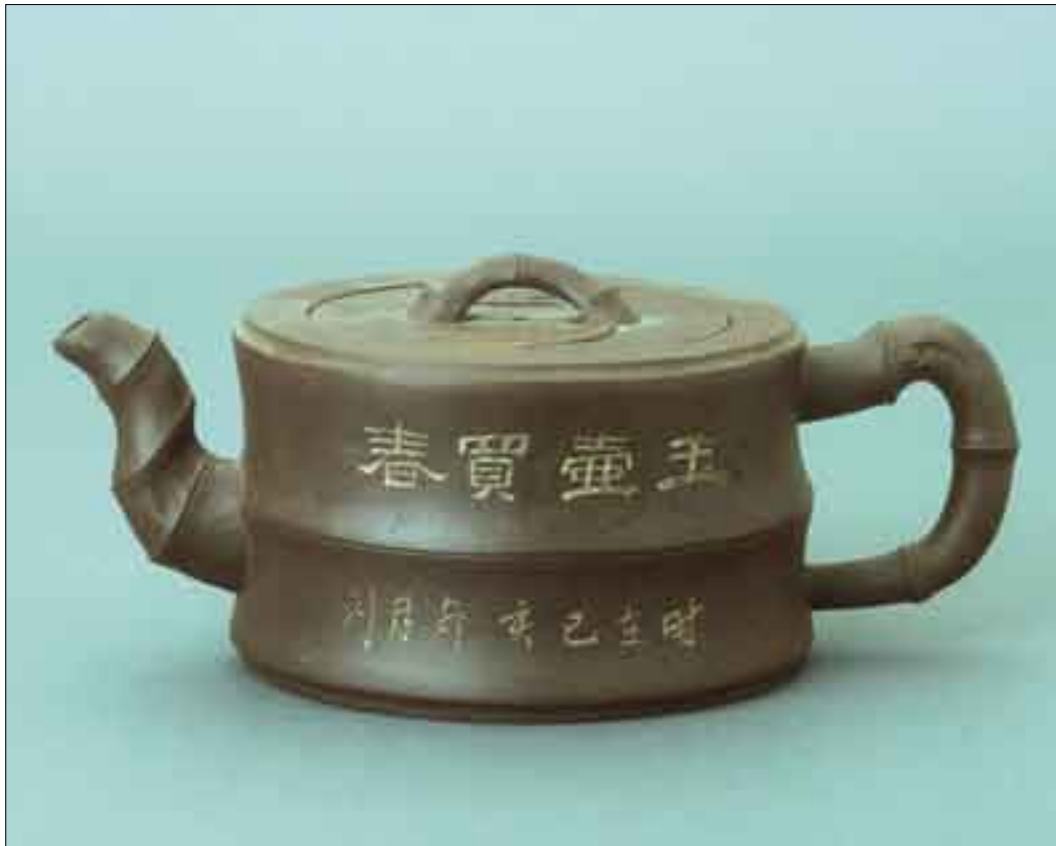
42 Bamboo shape early 20th century 3" x 7.25" x 4.5"