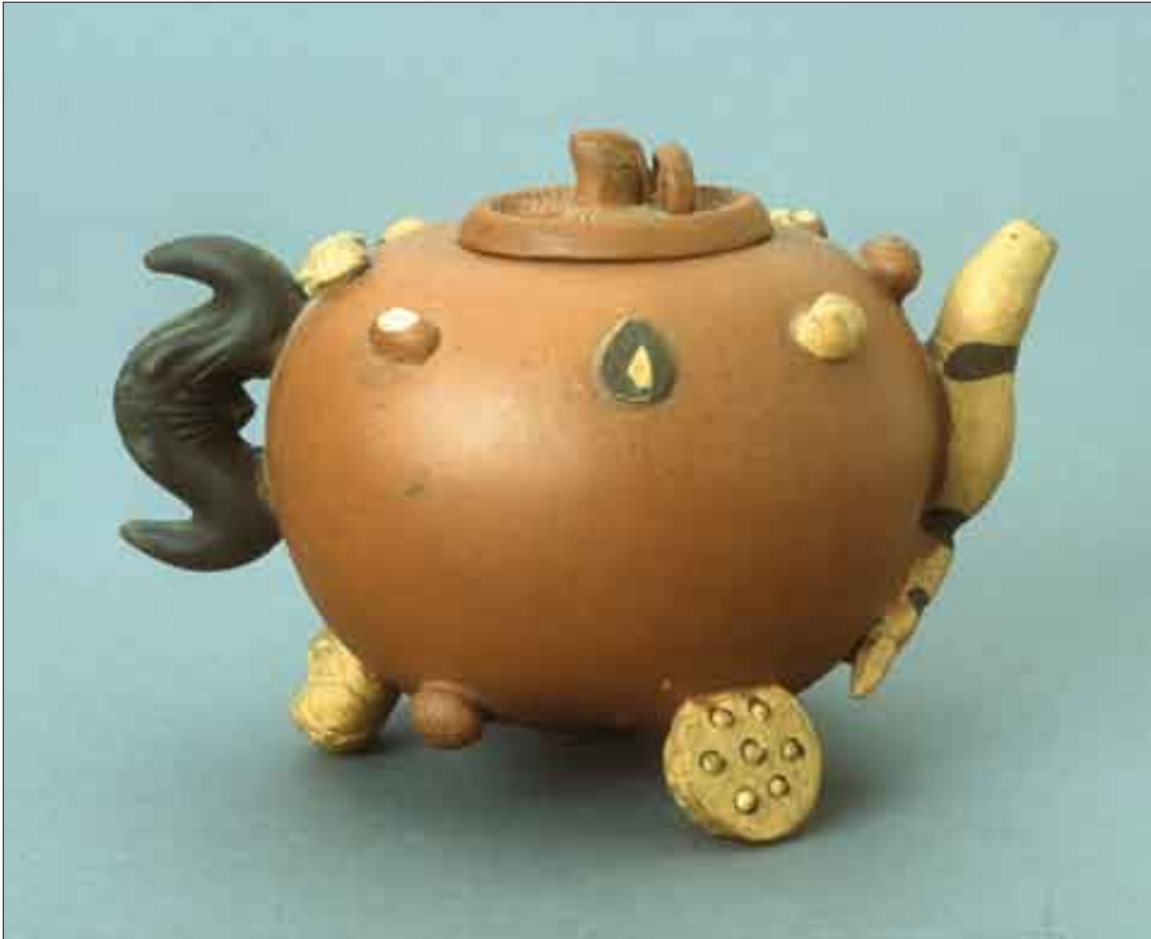
22 Pomegranate teapot with nuts and fruits late 19th century 4.75" x 7" x 4"