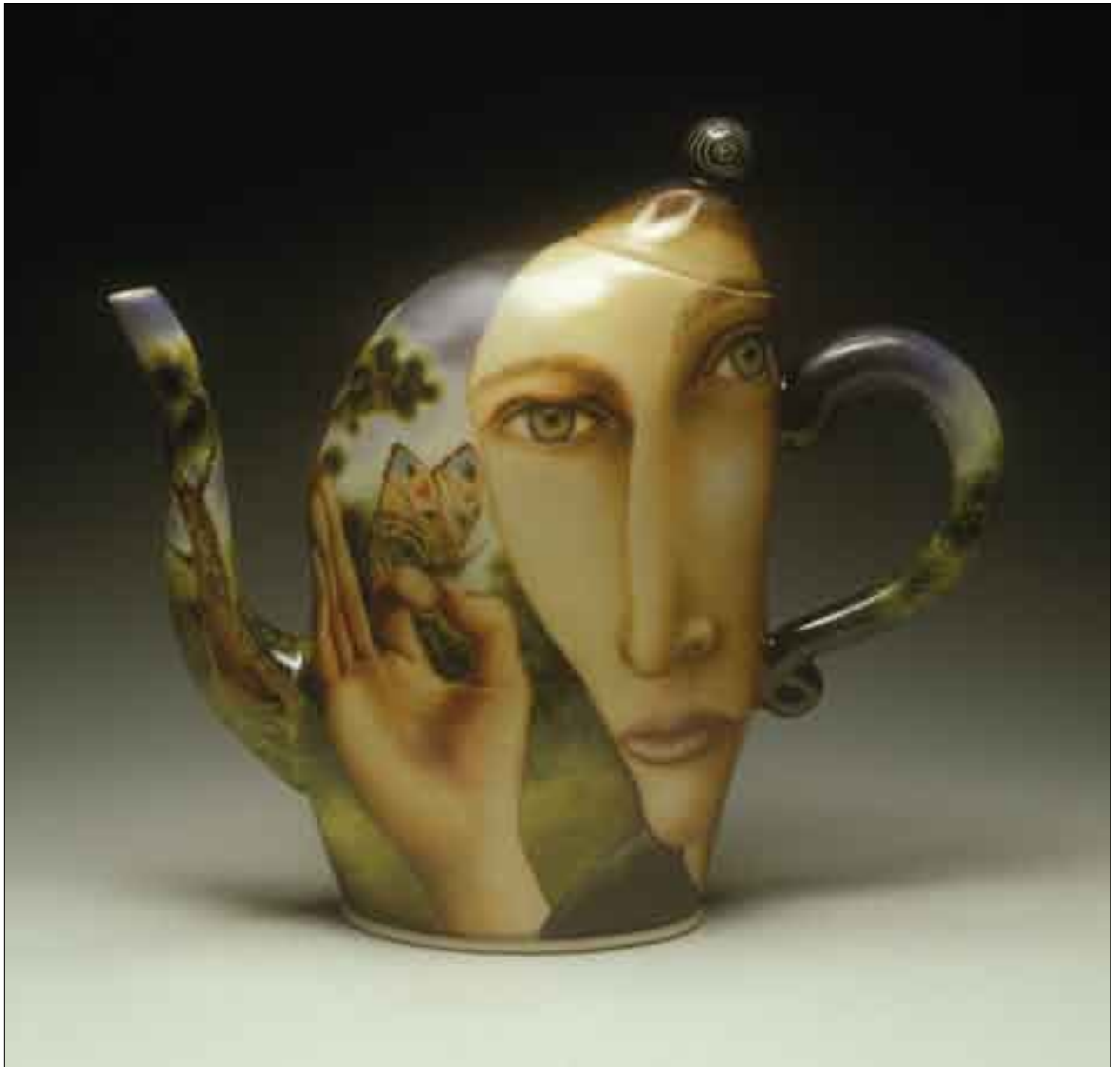
136 Kurt Weiser Inspection, 1996 porcelain, china paint 11.5" x 12" x 4.5"