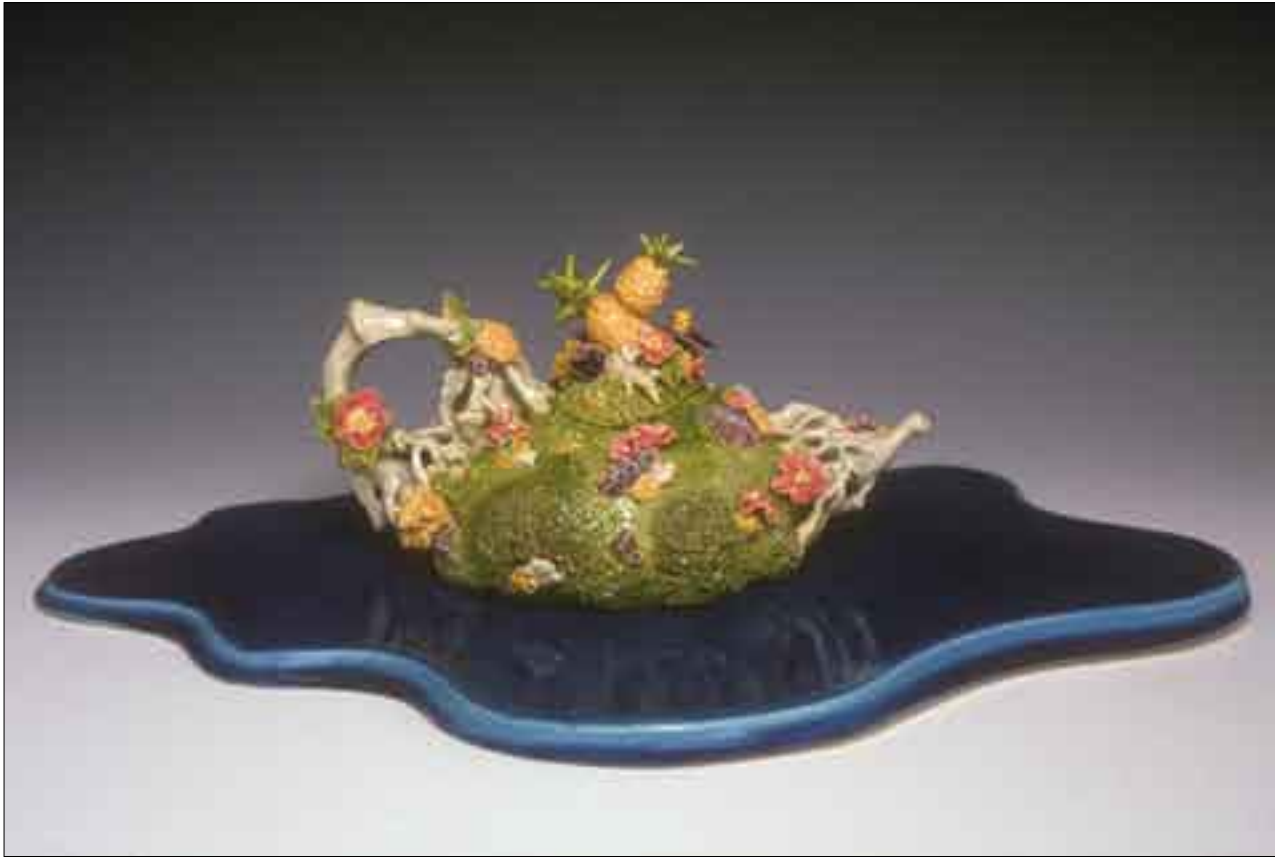
93 Joan Takayama-Ogawa Tropical Paradise, 1996 porcelain 7" x 10" x 15"