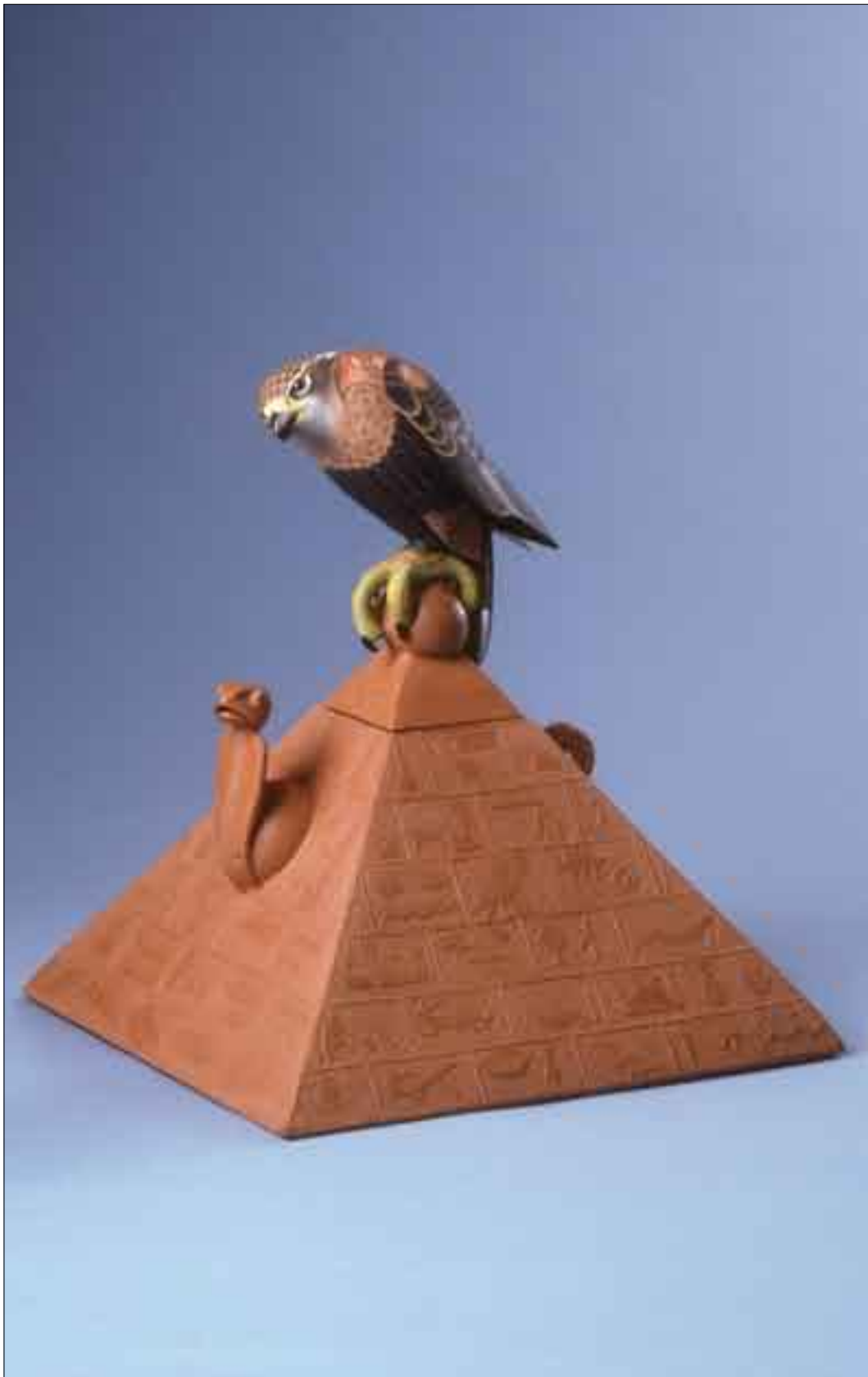
99 Annette Corcoran Red Shouldered Hawk, 1996 terra cotta, porcelain 12.25" x 11.25" x 11.25"