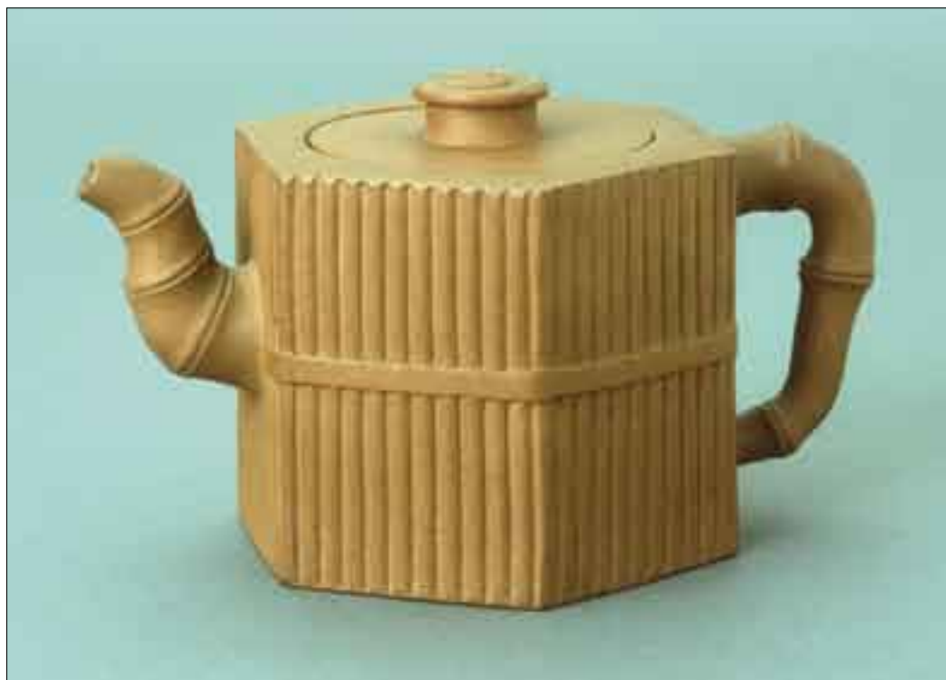
43 Hexagonal bamboo-bundle teapot late 19th century 4" x 6.5" x 4.25"