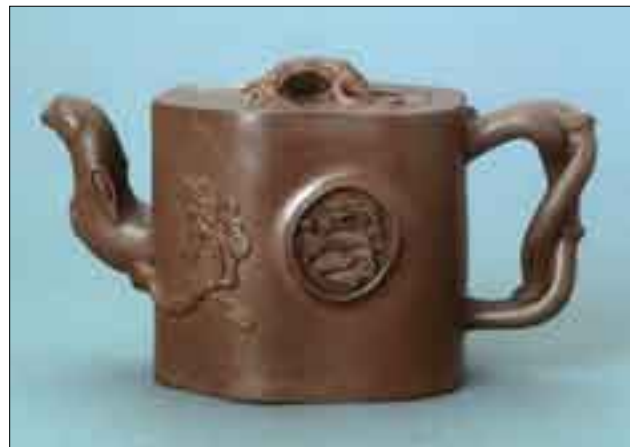
44 Bottom left: Prunus trunk-shaped teapot late 19th century 3.75" x 7.5" x 3.75"