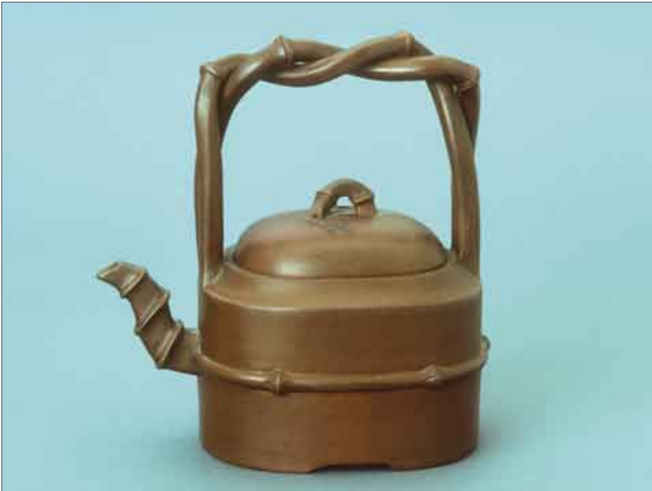
13 Bamboo-shaped teapot with overhead handle 20th century 7.5" x 7.25" x 5"